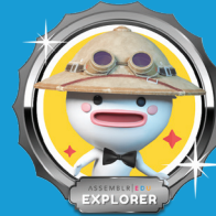
EXPLORER Level 4–6