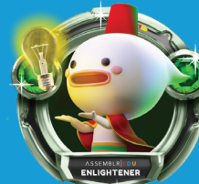
ENLIGHTENER Level 10–12