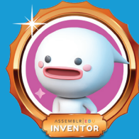
INVENTOR Level 1–3

As an ACE, you'll be categorized according to your level and ACE badge. When you reach certain levels and badges, you can also redeem exciting rewards!