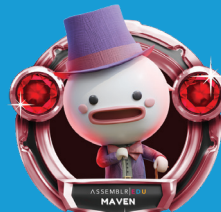
MAVEN Level 13–15