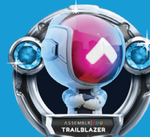
TRAILBLAZER Level 16–18