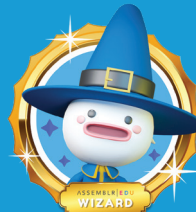
WIZARD Level 7–9